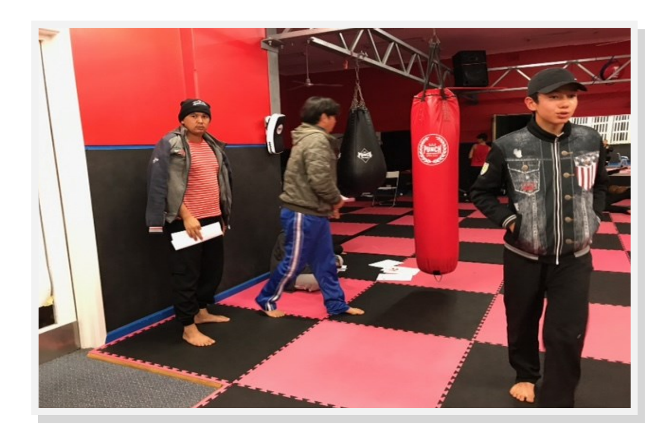
Boys from the Albany Hazara community waiting to get their health tests.